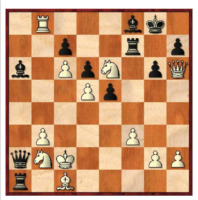
Qb1+ 42. Kd1 Qf5 43. Rxf8+ Rxf8 44. Qg7# 1-0

18. Ng3 a4 19. Qxb4 Na6 20. Qd2 axb3 21. axb3 Qb8 22. Nb2 Nd7 23. c6 Ndc5 24. Rc3 Qb6 25. Rhc1 Qa5 26. Kc2 Nb4+ 27. Kd1 Nxe4 28.Nxe4 Na2 29. Ng5 Nxc3+ 30. Rxc3 Qb4 31. Ne6 Ra1+ 32. Kc2 Rf7 33. Bg5 Bf8 34.Re3 Qa3 35. Re4 Qa2 36. Qb4 Rb1 37. Bc1 Ra1 38. Qd2 Bg7 39. Rb4 Ba6 40. Rb8+ Bf8 41. Qh6